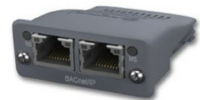
Insight Fieldbus Module for BACnet